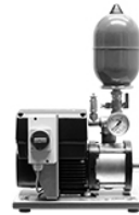
2017 ComBo easy – compact pressure boosting systems