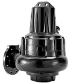
1996 FEC/FWC/FMC waste water and sewage pumps