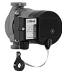
2010 Intelligent AXW with smart PM technology